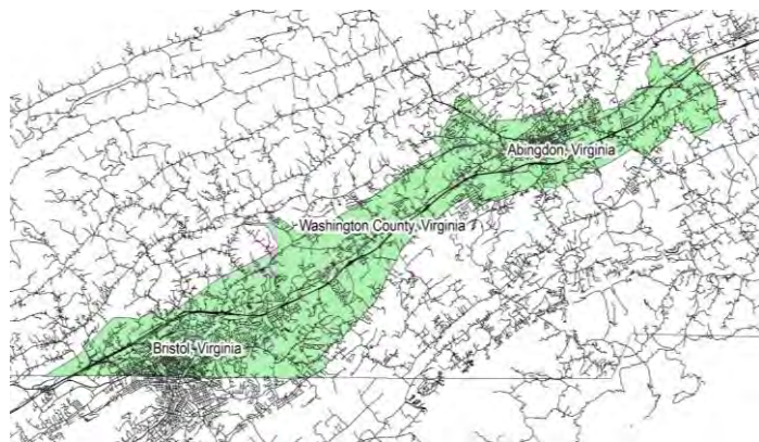
METROPOLITAN PLANNING AREA ELIGIBLE FOR NHPP GROUP FUNDED PROJECTS